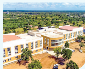
Engineering & Bio System Technology University of Jaffna