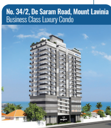
No.34/2, De Saram Road, Mount Lavinia Business Class Luxury Condo