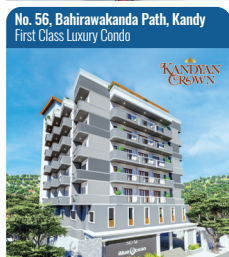
No.56, Bohirawakanda Path, Kandy First Class Luxury Condo