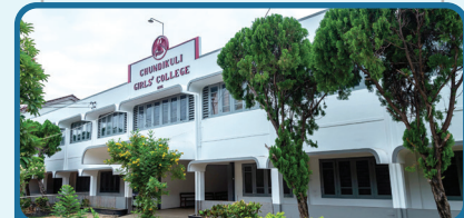
Chundukkuli Girl's School 550M