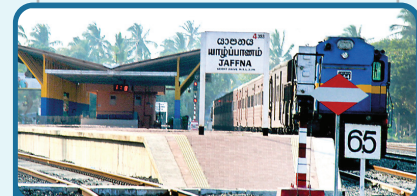
Jaffna Railway Station 1.3 KM