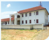
New Court Complex Chavakachcheri