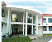
R. D. D. Office Jaffna