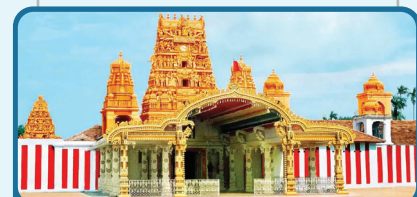
Nallur Kovil 1.9 KM