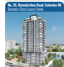
No.35, Ramakrishna Road, Colombo 06 Business Class Luxury Condo