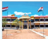
Faculty Of Engineering University of Jaffna