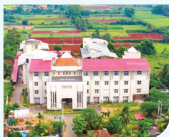
Faculty of Management University of Jaffna