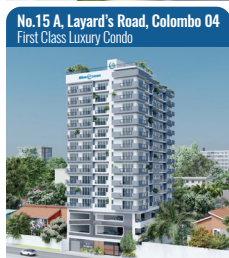
No.15 A, Layard's Road, Colombo 04 First Class Luxury Condo