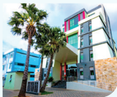
Water Board Regional Office Jaffna