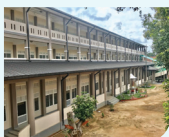
Holy Family Convent Jaffna