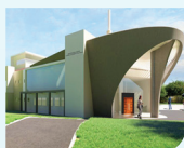
Building for Multipurpose Auditorium Trincomalee Campus