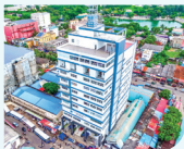
Faculty of Medicine University of Jaffna