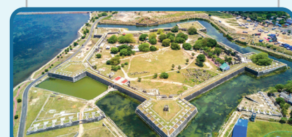
Jaffna Fort 2.5 KM