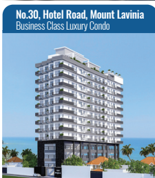
No.30, Hotel Road, Mount Lavinia Business Class Luxury Condo