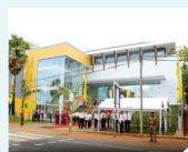
Bank of Ceylon Super Grade Branch Trincomalee