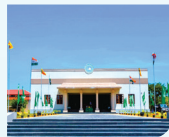
Faculty of Agricultural & Engineering University of Jaffna