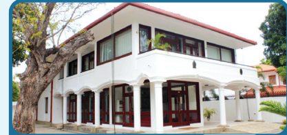
Governor's Secretariat 240M