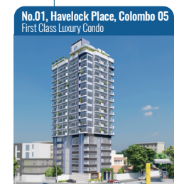
No.01, Havelock Place, Colombo 05 First Class Luxury Condo