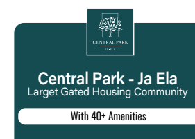
Central Park - Ja Ela Largest Gated Housing Community