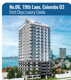
No.06, 19th Lane, Colombo 03 First Class Luxury Condo