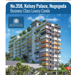
No.358, Kelsey Palace, Nugegoda Business Class Luxury Condo